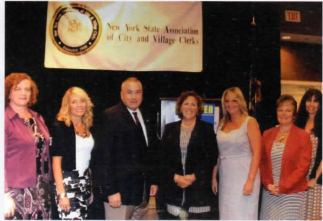
NYSACVC Executive Committee 2016 - 2017

For a listing of Executive Committee members please refer to page 2 of this issue of The Bulletin!